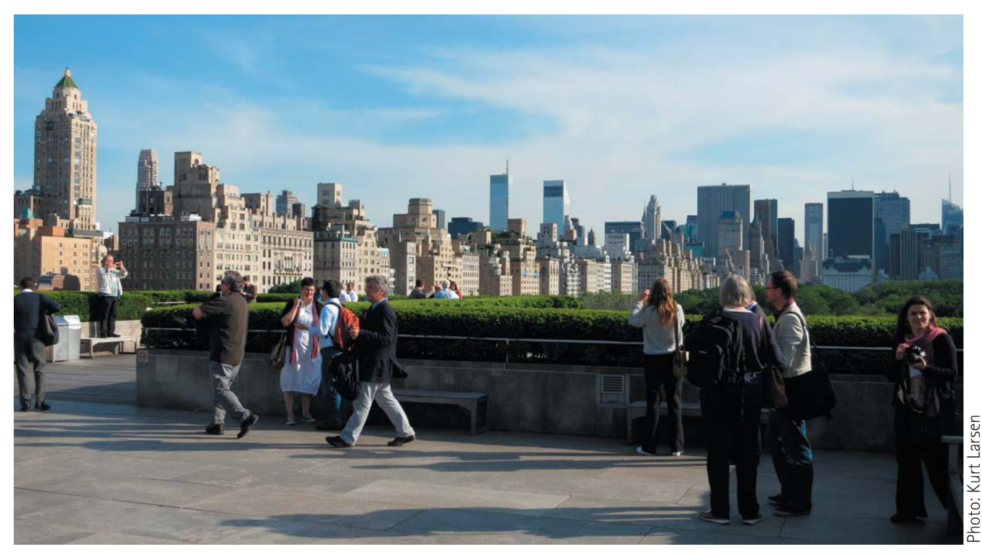
Wine reception - and a breathtaking view of the Manhattan skyline and Central Park from the roof garden of the Metropolitan Museum.

After long days of sitting through interesting papers, the local organizers had wisely arranged for an evening of physical activity at the Hungarian House not far from the MET. For several hours traditional Eastern European music alternated with »participant observation« as CIMCIM and AMIS members alike joined hands and let themselves go in Balkan dances to the accompaniment of the Zlatne Uste Balkan Brass Band.