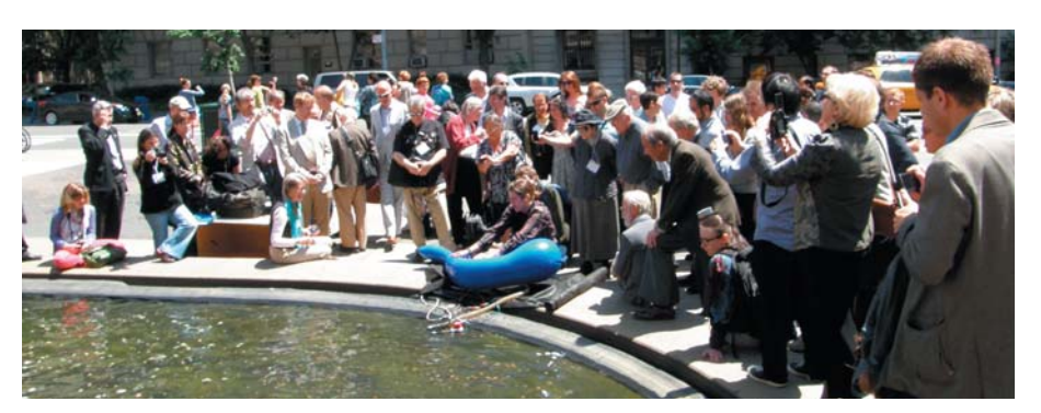
CIMCIM and AMIS members researching new instruments.

This has been the second CIMCIM conference Lattended and I found both of them. essential for my research and personal development. The travel fund provided by CIMCIM made it possible for me to join the great event this year. I would like to thank the CIMCIM board and members for all the financial and mental support they provided me during the application process and the conference. With the help of this grant, I had the chance to present my research and get feedback from colleagues. I encourage everyone interested in organology, musicology, museums of musical instruments and collections, musicians to be a member of CIMCIM and attend the annual conferences to be a part of this network. Especially, young researchers should not miss this chance.