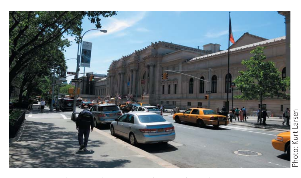
The Metropolitan Museum of Art seen from 5th Avenue.