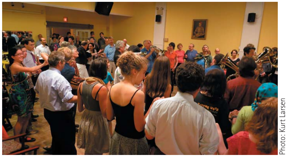
CIMCIM and AMIS members dancing to Balkan music at The Hungarian House.

Ideally our next meeting should be an integral part of the triennial ICOM conference in RIO, Brazil. However, as we have